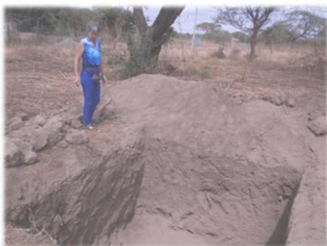
Heidi admiring hard work done in digging the septic tank hole.